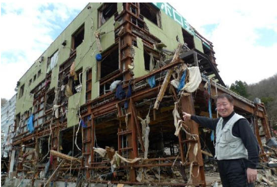
Bihoro Hall in Onagawa City