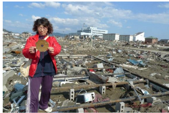
This is where Ishinomaki Office used to stand

On April 27 th and 28 th , JWCU's newsletter staff visited Tohoku. Presidents of the member organizations took him and showed the damage on our members and the whole communities.